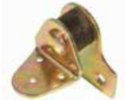
Table Flip Bracket